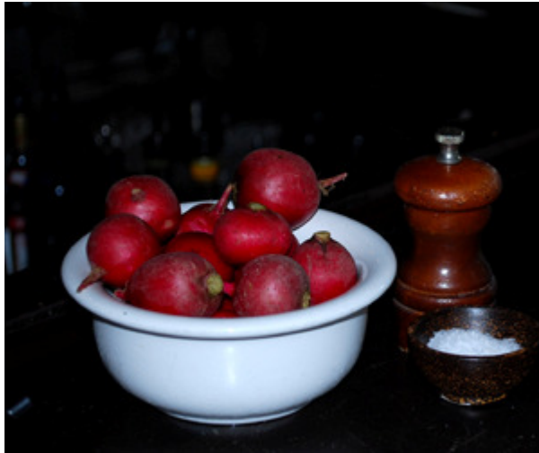
Yes...the bar snack at Michael's Genuine! Fresh crispy red radishes and Sea Salt