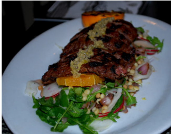
Grilled Harris Ranch Skirt Steak Salad, with onions, fregola, radish, arugula, fennel, citrus and olive tapenade