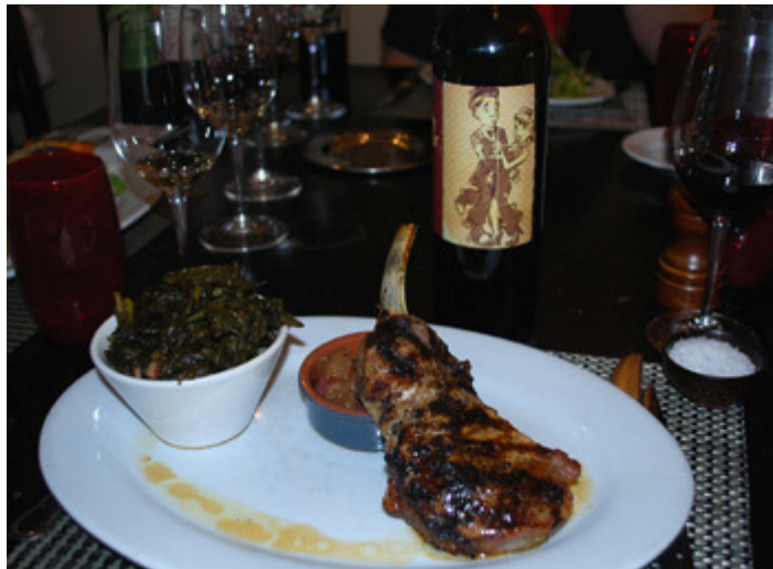
Pork Chop at Michael's Genuine with Mollydooker's Two Left Feet Shiraz / Cab / Merlot Blend in background