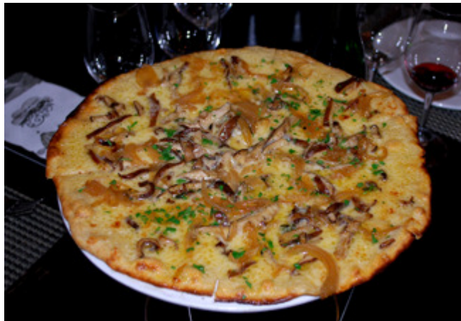
Crispy Shitake Mushroom Pizza with cave-aged Gruyere cheese, caramelized onions and fresh thyme @ Michael's Genuine