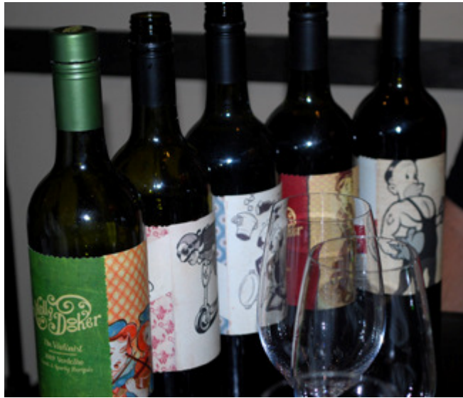
Mollydooker's attractive bottle packaging...The Violinist Vedelho on left, The Boxer Shiraz far right

Mollydooker concept and portfolio will give you goose bumps too!